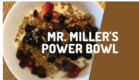
(Length: 4:39. Click on video.)