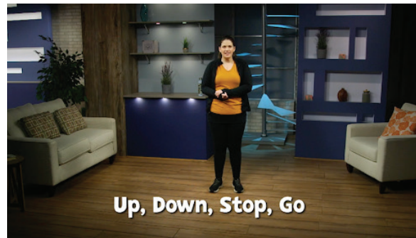
(Length: 7:52. Click on video.)